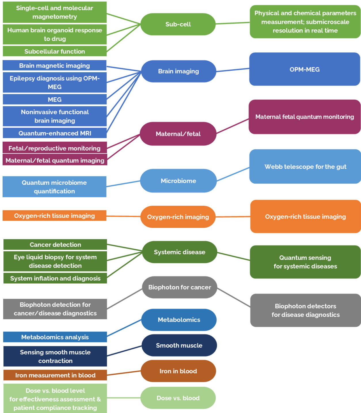
Figure 2: Filtering of Biomedical Use Case Ideas in Workshop Discussions MEG = magnetoencephalography; MRI = magnetic resonance imaging; OPM = optically pumped magnetometer