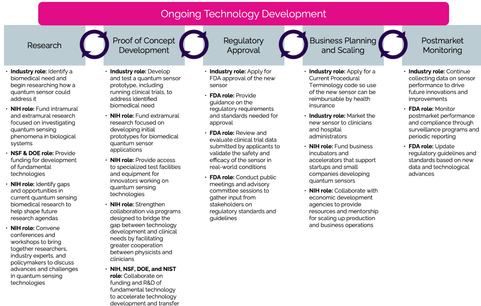
Figure 1: Pathway to Commercialization for Quantum Sensor Biomedical Applications: Agency and Industry Roles